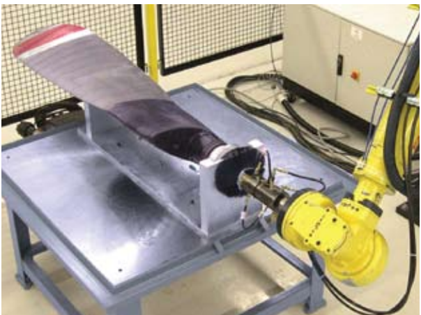
The LPB process completely eliminated the occurrence of fretting, which leads to cracking, in the neck segment of a medical hip implant (above left). It also increased the fatigue strength of the implant by 40 percent and the lifespan by more than 100 times. Performed in a machine shop environment, in the field, and by using industrial robotic tools (above right), LPB can be applied to new or old metal components.

Prior to completing its work with NASA, Lambda patented the LPB process and created a spinoff company, Surface Enhancement Technologies LLC, to market LPB. In 2010, LPB earned recognition as one of the "R&D 100" (a list of the top 100 inventions of the year), granted by R&D Magazine .