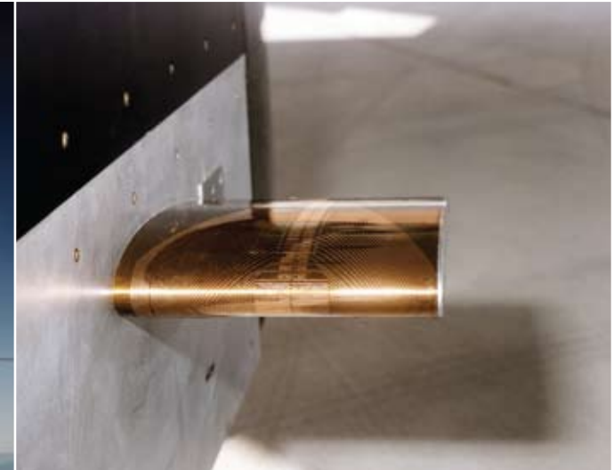
Dryden Flight Research Center's F-15B test bed aircraft flew several flights to determine the location of sonic shockwave development as air passes over an airfoil. The shock location sensor (above), developed by Tao of Systems Integration Inc., isolated the location of the shock wave to within a half-inch.

"Today we measure the impact of aerodynamic forces primarily through structural measurement devices such as accelerometers, gyroscopes, and strain gauges. We need sensing systems to measure aerodynamics independently of structures and actuation," says Mangalam. An aircraft's wings, for example, act like low-pass filters: They do not respond quickly enough to aerodynamic disturbances like turbulence to allow structural sensors to capture what the forces are doing in real time.