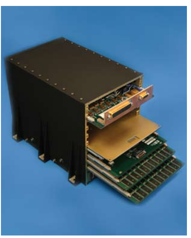
SEAKR's SSRs have become mission-enabling technologies, playing a vital role in many NASA missions and onboard multiple commercial satellites.

SEAKR's technological accomplishments continue to push the limits of solid-state space electronics. Through the Internet Routing in Space project, the company collaborated with Cisco Systems and the Department of Defense and built a space-hardened Internet router that allows Web access and communications to occur directly through satellites rather than double-hopping to and from