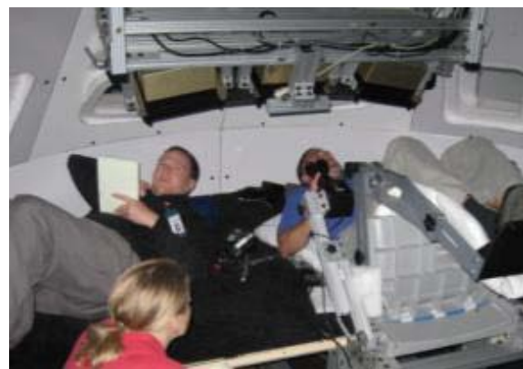
Figure 2: 2008 Study in ROC Mini-Dome Figure 3: 2010 Study in ROC Beta-Dome

The first handling qualities study in 2008 generated overall Cooper-Harper scores of 2-5 depending on the task and test subject. The Cooper-Harper rating begins with an assessment of the vehicle's "Adequacy for Selected Tasks or Required Operation" in which the subject decides if the performance achieved was desired, adequate or