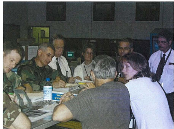
Figure 3. Post-launch "hot wash" allows 45WS and its contractors (including the AMU) to discuss concerns and "lessons learned" from the operation.

Co-location with the customer was strongly recommended by the NRC report (National Research Council, 1988, page 45). This assures that the AMU and its customers communicate daily and have direct experience of each other's "worlds". The AMU also provides at least one person to attend all space launch attempts. This is done in case no-notice technical advice is needed, and also to help the AMU to maintain awareness of how weather operations to space launch are conducted. For example, AMU personnel attend the "hot wash" (Figure 3) after every launch or launch attempt. The hot wash is an open and free discussion among 45WS and its support contractors (including the AMU) regarding any problems or concerns arising from the operation just completed. Because of the co-location with Range Weather Operations and participation in operations, the AMU is instinctively aware of the capabilities and limitations of the 45WS, and they are aware of AMU capabilities and limitations. The result is that 45WS proposes better taskings and the AMU delivers better products than would otherwise be likely.