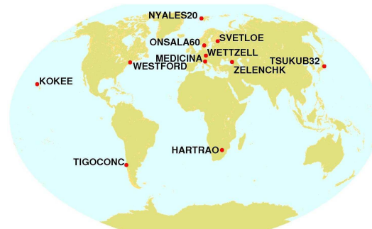
Figure 1. CONT08 VLBI station network.

( http://ivscc.gsfc.nasa.gov/program/cont08/ )