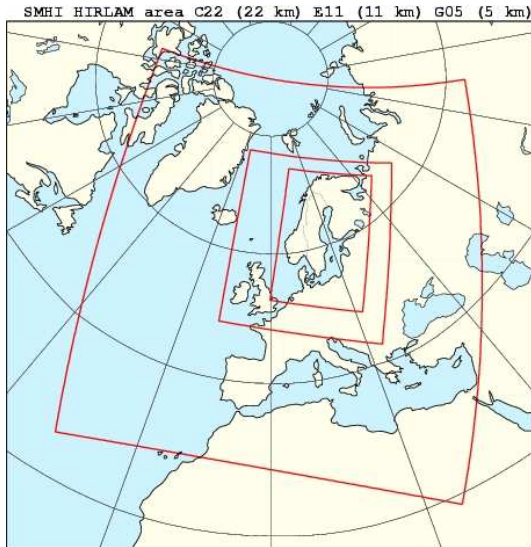
Figure 1. HIRLAM horizontal grid.

The forecast model is a limited area model with a boundary relaxation scheme. The model exists both in a grid-point version and in a spectral version.