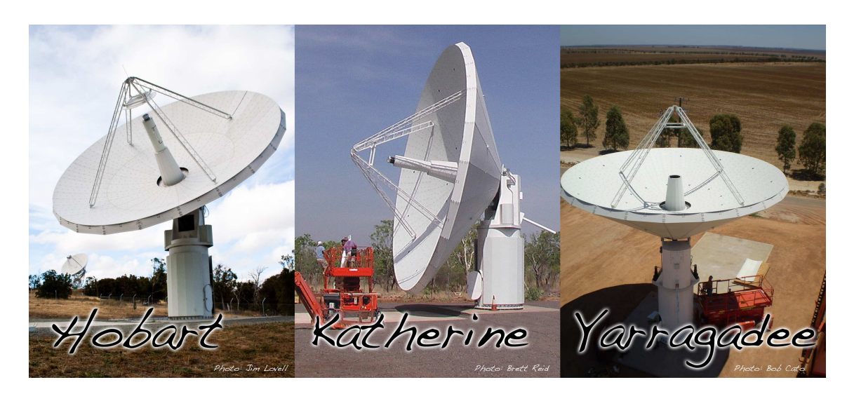
Figure 2. The three AuScope VLBI sites as of March 2010.

At time of writing (April 2010) the Hobart antenna is installed and initial end-to-end testing of the system is under way. Interferometric fringes between the 12 m and 26 m antennas have been detected. Once the hardware and software for Hobart have been completed and tested, duplicate systems for the other sites will be built and tested at Hobart prior to deployment. At Yarragadee, the antenna is in the final stages of acceptance testing, and acceptance tests will take place in Katherine next.