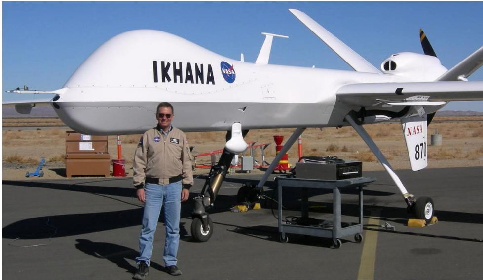
Figure 1. NASA Research Pilot Mark Pestana and the MQ-9 Ikhana UAV. The aircraft is 36 feet long, the wingspan is 66 feet, and the weight is 10,000 lb. Note the two small camera windows in the nose.

Although many airplanes are equipped to fly in weather conditions where visibility is very restricted (known as instrument flight), visual contact with the runway and airfield environment is always required for taxi, takeoff, and landing. During flight at altitude, a wide field of view aids in maintaining safe separation from other aircraft. During approach and landing, the most critical and demanding phase of a flight, even peripheral vision is important because wide visibility offers the pilot a sense of motion and rate of descent as he attempts to land as smoothly as possible.