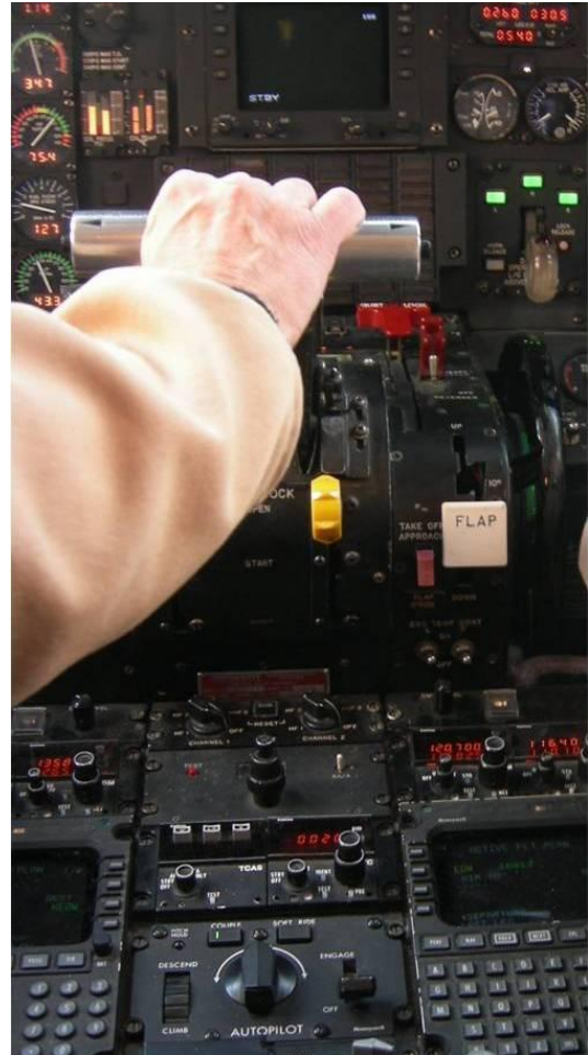
Figure 6. Typical cockpit displays and controls. Analog gauges marked with normal (green arc) and red-line ranges of values (upper left). Distinctively shaped flap handle, landing gear handle (below the three green lights), and autopilot switches (lower center) enable multitasking without diverting attention to look at them. Green landing gear lights are “mapped” in relative positions to nose and main landing gear.

In the case of the MQ-9 control station, which is contained in a mobile trailer or a building, almost all of the “switches” are activated by a keyboard (essentially, identically-shaped “switches”) and a trackball. The switches are menu-driven commands, embedded in software, and displayed on various screens. The pilot faces four screens. One screen displays a forward-facing camera’s view, another displays maps with a moving aircraft icon; two others display systems information, cautions and warnings, and operations menus that are selectable through a keyboard and mouse or trackball (Fig. 3). On these informational-cautionary screens, one “page” of information is shown at any time, but more than 60 additional pages are available. Each page contains different types of information about systems performance (for example, servo amperages, fuel tank quantity, rudder deflection, and planned route of flight). The control station is also equipped with traditional control stick (Fig. 3), throttle or prop levers, and rudder pedals required to fly the aircraft from taxi, through takeoff, cruise, descent, and landing. Also