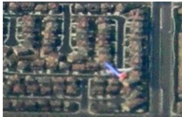
Figure 8. Airliner seen against city background. This particular airliner is painted in bright colors, which helps in distinguishing it against the background. UASs, in order to comply with FAA procedures and regulations regarding “sense and avoid” capabilities, will likely require a fusion of data sources (that is, visual, radar, and infrared) provided to both UAS pilots and air traffic controllers.