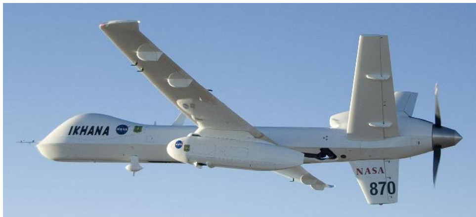
Figure 2. Ikhana equipped with a wing-mounted pod, carrying an infrared sensor for a wildfire research mission. The UAS is capable of transmitting imagery and locations of hot spots and fire lines directly to fire incident commanders via a satellite link.