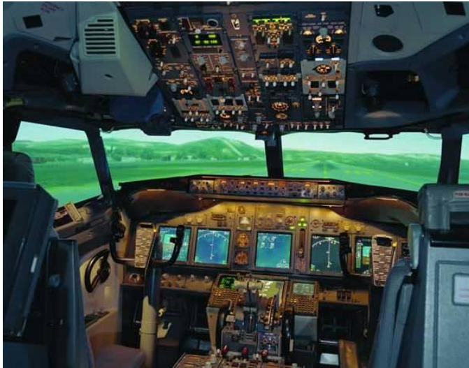
Figure 5. Manned aircraft, with multiple windows, provide a wide field of view to pilots. Digital information can be displayed in human-friendly analog format on the multifunction display screens.

Similarly, traditional cockpit displays (Figs. 5 and 6)—mostly analog gauges—have needles that point at numerical values. Many gauges are labeled with “green arcs” and “red lines,” indicating the normal range of values, or limits, respectively. During typical flight, the pilot routinely devotes time and attention to the assessment of information. A quick glance across analog gauges affords the pilot a “normal” assessment if gauges are pointing in normal directions; the pilot does not need to read the actual numbers. In the same glance, the pilot can detect a needle pointed in an “abnormal” or “unsafe” direction, and assess that condition by noting the numerical value. In digital presentations, precise numbers are displayed, but the pilot must take precious moments to determine whether each number is within the normal range or is trending toward the abnormal.