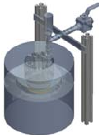
Figure 2. Test fixture. The heating chamber has a sample volume of approximately 7.62cm diameter and 1.27 cm height.

Shaved ice method: In this method, small particles of ice are created with an off-the-shelf ice shaving machine. The ice and the shaver are located inside the walk-in freezer, to prevent incipient melting which could later re-freeze and weld the particles together. The ice shavings are mixed with dry frozen soil in the proper ratio. The mixture is placed inside a soil sieve (diameter 7.5 cm and pore size 30 μm). The sample mixture and the test fixture sample holder are bathed in liquid nitrogen, then the sample is re-weighed and placed in the sample holder. The test begins as soon as the wiring is connected (about 10 minutes is required).