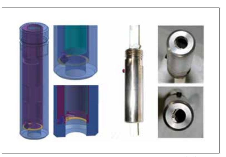
The Rolling-Tooth Design of the core breakoff and retention mechanism (left), and the assembled parts (right).

While drilling, the two tubes are positioned relative to each other such that the sample tube is aligned with the drill tube axis and core. The drill tube includes teeth and flutes for cuttings removal. The inner tube includes, at the base, the rolling element implemented as a wheel on a shaft in an eccentric slot. An additional slot in the inner tube and a pin in the drill tube limit