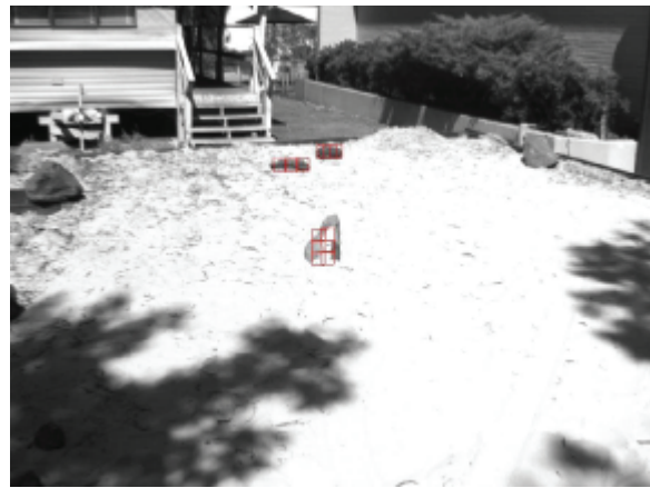
Turn-in-Place Experiments show beginning image (left) and end image (right) after 80° rover rotation. As the rover turns, the mast camera turns in the opposite direction to point to the target.