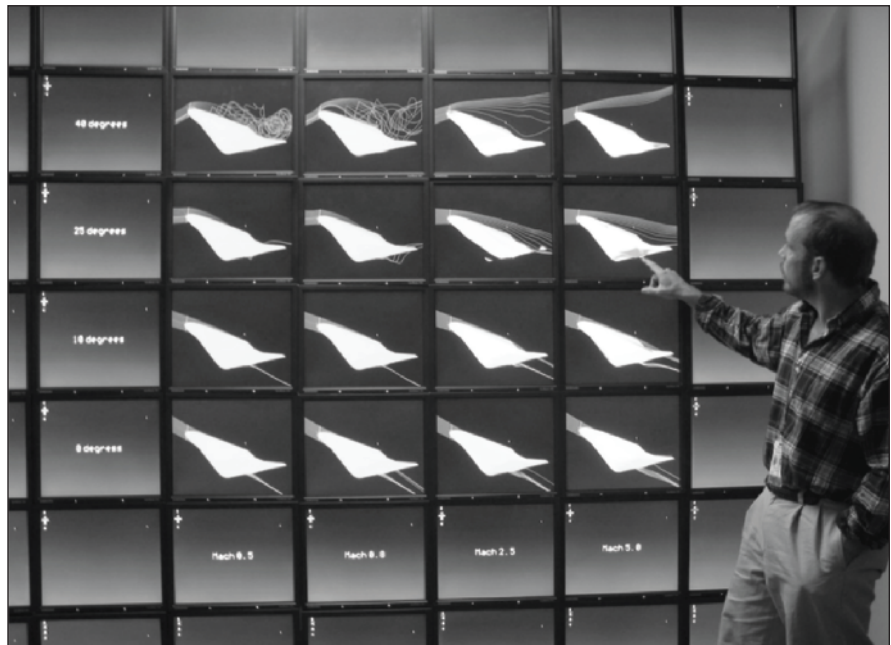
Figure 2. Each of 16 Images displayed on a hyperwall represents results of a computational simulation of airflow about an aerospacecraft (specifically, a proposed reusable launch vehicle) at one of 16 different combinations of Mach numbers and angles of attack.