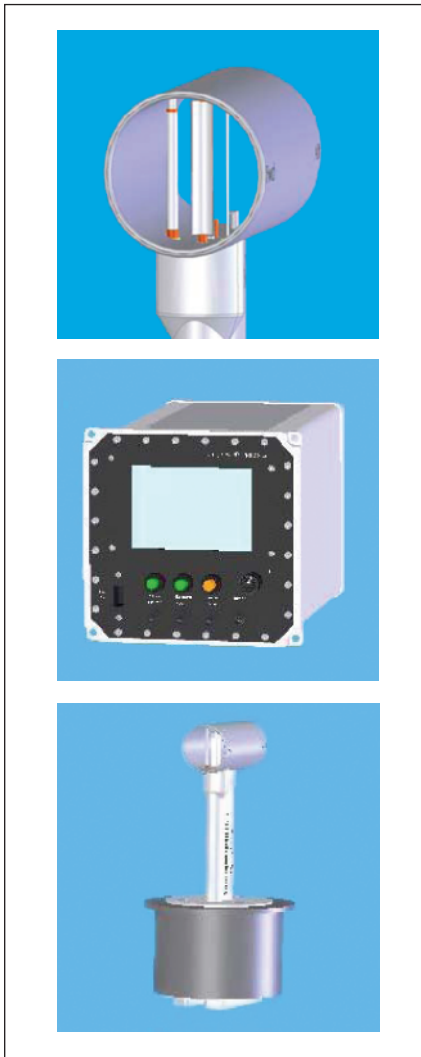
The Sensor Head (top) contains three hot-wire sensors oriented perpendicularly to the axis of the tube (across the flow) and one parallel to the axis of the tube (along the flow). The general views of the cockpit display and the sensor are shown, respectively, in the middle and bottom images.

ing elements have different shapes and sizes and, therefore, exhibit different measurement efficiencies with respect to droplet size and water phase (liquid, frozen, or mixed). Three of the hot-wire sensing elements are oriented across the airflow so as to intercept incoming cloud water. For each of these elements, the LWC or TWC affects the power required to maintain a constant temperature in the presence of cloud water.