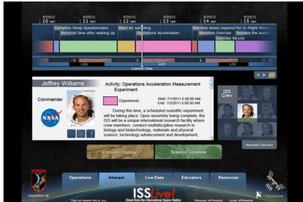
Figure 2. Concept View of the Crew-Specific Timeline Screen in ISSLive!