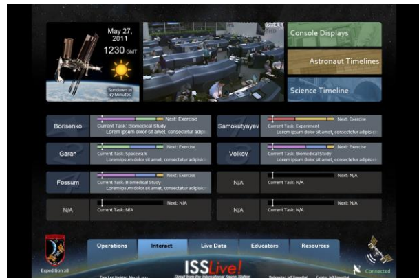
Figure 1. Concept View of the Overview Timeline Screen in ISSLive!

University, it was shown that there is an interest in knowing what is going on onboard the ISS, and that during certain activities such as extra-vehicular activity (or a spacewalk) this interest increases greatly. 2 Due to this demonstrated interest in the daily lives of astronauts on board, ISSLive! includes several different timeline displays for the public. The first display, as shown in figure 1, provides an overview for all of the crew members onboard at the specific time of day that the user is looking at.