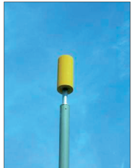
Figure 2. A Cylindrical Windscreen Covers a Microphone mounted on a pole outdoors.