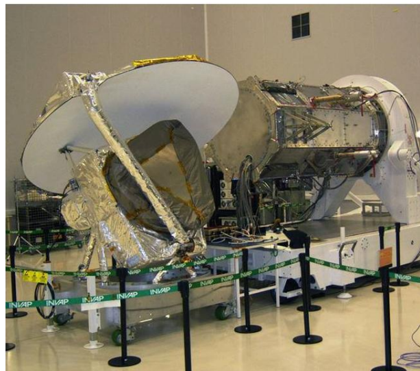
Fig 3: Aquarius (left) and the SAC-D spacecraft bus (right) during tests of the electrical interface at INVAP in Bariloche, Argentina.