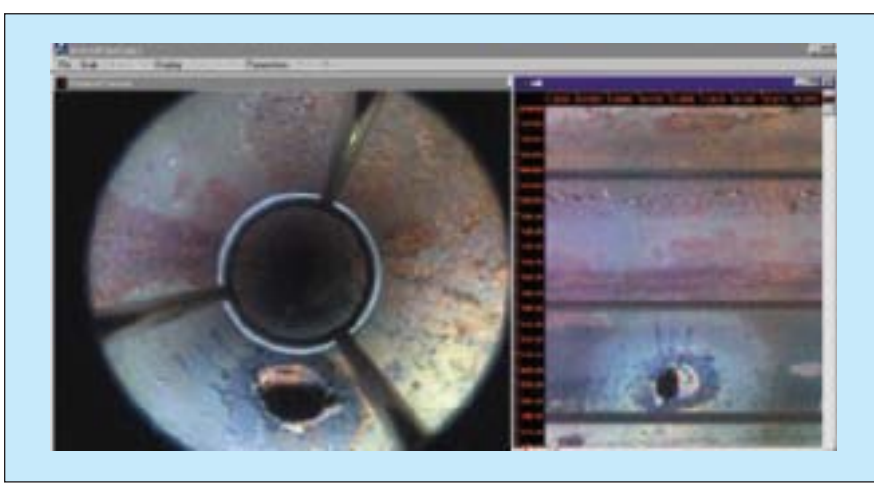
Figure 2. A Picture Taken Looking Along a Pipe is distorted (warped) by the combined effects of the lens and the viewing geometry (left). The image data are processed to unwarp the image (right), yield-ing an undistorted radial view.

pensates for the decrease in illumination with distance from the ring of LEDs.