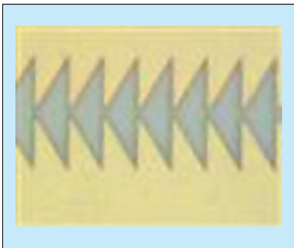
Figure 1. Sample X-Ray Mask is shown with a period of 9 \mu\text{m} and gold thickness of 5 \mu\text{m} .