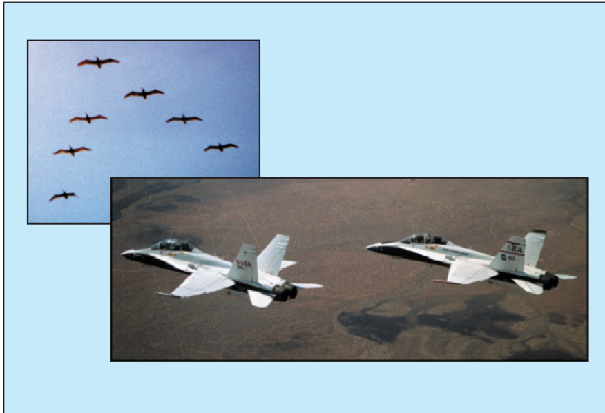
Figure 1. Formation Flight offers the advantage of reduced overall drag for both birds and airplanes.

The AFF project will involve three phases, with flight tests beginning in the first quarter of fiscal year 2001 and completion by the end of fiscal year 2003. The first phase, which has taken place, was devoted to the demonstra-