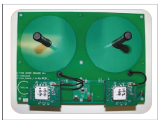
The Central Station Hardware includes communication modules that contain generic RF circuit boards. Identical communication modules are used in the remote stations.

The output power of the radio transmitter in each station is made low (≈10 mW) to minimize interference. The range of each station is 300 feet (about 90 m) with a small whip antenna and can be increased by use of a directional antenna. The system is based on a spread-spectrum transceiver and uses an in-house developed algorithm to central communication over more than 100 frequency pairs on a 433- or 918-MHz base frequency. The wireless links currently operate at a data rate of 19.2 kb/s, but are capable of 115 kb/s.