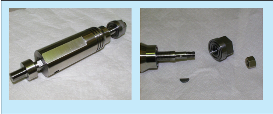
This Mechanism Applies All the Loads needed for self-reacted friction stir welding.

The welding pin and shoulder can be assembled and disassembled quickly. An additional advantage of the present mechanism is that it affords positive seal-