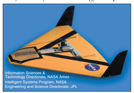
Photograph shows the Biomorphic Flyer Plat form . The platform was successfully demonstrated in 2001.

The advantage of the ocelli over a similarly sized system of rate gyroscopes is