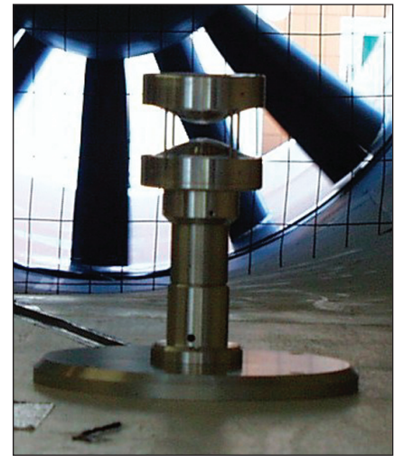
Figure 1. A Prototype Three-Dimensional Ven turi Sensor is shown here mounted in a wind tunnel for testing at Embry-Riddle Aeronautical University, FL.

ing limited dynamic range and susceptibility to errors caused by external acoustic noise and rain.