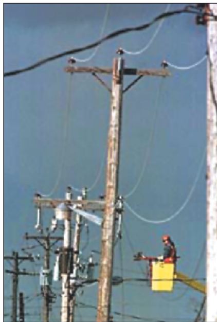
Ice Accumulating on Power Lines poses a hazard. Gauges like those described in the text can provide early warnings of the buildup of ice.

A gauge of this type includes a temperature sensor and two or more pairs of electrically insulated conductors embedded in a surface on which ice could accumulate. The electrical impedances of the pairs of conductors vary with the thickness of any ice that may be present. Somewhat