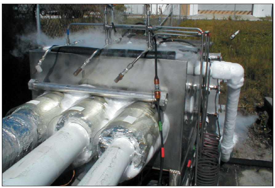
Thermal Guard Boxes at the ends of a pipe under test are used to make the fluid connections to the pipe. In addition, a temperature control device imposes a specified temperature on the outer surface of the pipe insulation.

The thermal guard boxes keep the ends of the pipes at the lower interior temperature to prevent spurious lengthwise leakage of heat into the pipes. It is important to prevent this spurious heat leakage because, if it were allowed to