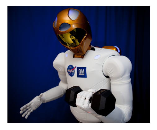
Figure 1: Robonaut 2.

In particular, a multi-tiered software architecture is proposed that combines principles of low-level feedback control with higher-level planners that accomplish behavioral goals at the task level given the run-time context, user constraints, the health of the system, and so on. The proposed architecture is shown in Figure 2. At the lowest-level, the resource level , there exists the various sensory and motor signals available to the system. The sensory signals for a robot such as R2 include multiple channels of force/torque data, joint or Cartesian positions calculated through the robot's proprioception, and signals derived from objects observable by its cameras. The motor resources are the