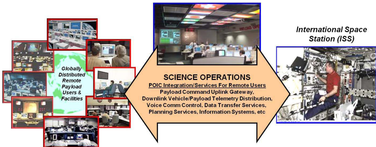
Figure 2. ISS Distributed Payload Operations

The POIC is an ISS facility that manages on-orbit ISS payloads and payload support systems in coordination with the MCC-H, the International Partner (IP) Payload Control Centers (PCCs), TSCs, and payload-unique facilities, as shown in Fig. 2. It is responsible for planning, integration, and operation of ISS on-orbit payloads. It is physically located within the HOSC at MSFC. The POIC provides command, telemetry, database, planning, information management systems, voice services, etc. for local, remote, and a globally distributed ISS payload user community.