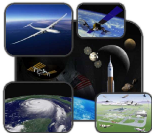
Figure 3. Future NASA Missions. Extend and sustain human activities across the solar system, expand scientific understanding of the earth and the universe in which we live, and advance aeronautics research for societal benefit.

Meeting these challenges and continuing to remain a preeminent research and development center through the year 2050 and beyond will require building advanced, flexible, and sustainable research and development facilities. These facilities will require state-of-the-art equipment and an interconnected information technology infrastructure to achieve the future NASA mission and to attract, retain, and promote the brightest minds necessary to create the future.