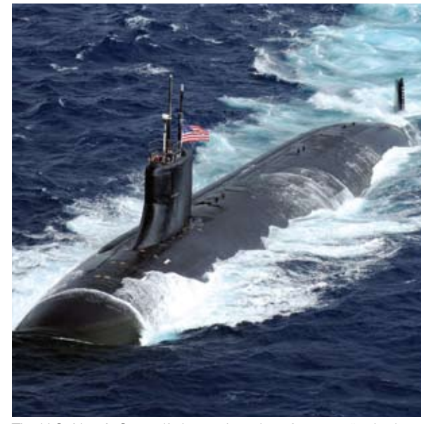
The U.S. Navy's Seawolf class submarines feature a "swim-by-wire" system adapted by NASA partner Draper Laboratory from the Lab's work during the DFBW program.