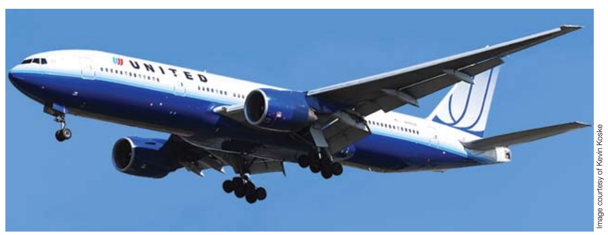
In 1994, the Boeing 777 became the second commercial airliner to fly using DFBW. For commercial aircraft, the replacement of heavy mechanical systems with DFBW controls provides greater fuel efficiency or the ability to carry more passengers or cargo.

of F-8C Crusaders from the Navy and, working with Draper, the Center installed an adapted extra Apollo PGNCS on one of the planes, which became the Digital Fly-by-Wire (DFBW) research aircraft. Another of the F-8s was converted into an "Iron Bird" ground-based simulator for testing the flight software and training pilots, and the third F-8 was used to familiarize test pilots with the aircraft.