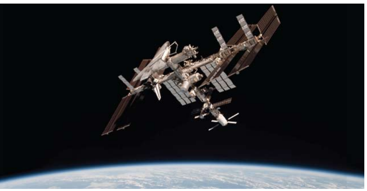
Space radiation can interfere with the electronics on the International Space Station (ISS). High-energy particles switch electronics off and can cause them to enter a hung state. Here, the ISS is shown with Space Shuttle Endeavor on May 23, 2011.

As a testament to the company's success, in 2011, Space Micro was selected by the Small Business Administration as a winner of the prestigious "Tibbetts Award" in recognition of small businesses and SBIR support organizations exemplifying the types of business, economic, and technical development goals of the SBIR program.