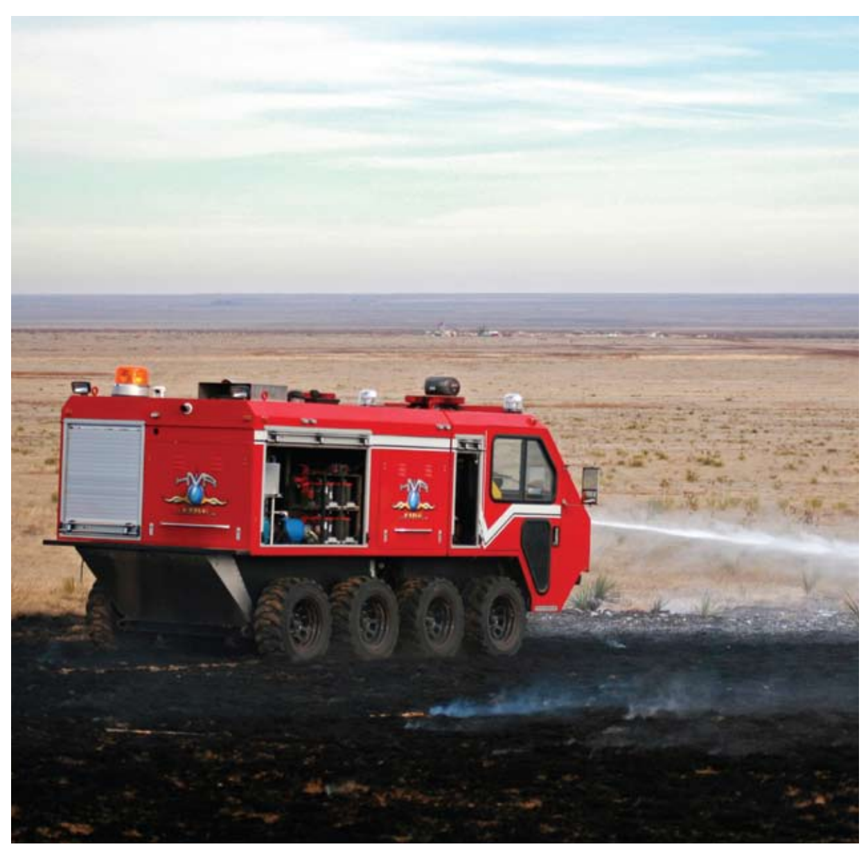
HMA's fire suppression technology is ideal for a host of firefighting applications, including combating wildfires in areas unreachable by standard fire trucks. Here, HMA's L3 (light, lean, and lethal) vehicle demonstrates these capabilities.

Hydrus<sup>TM</sup>, T4<sup>TM</sup>, T6<sup>TM</sup>, and Proteus<sup>TM</sup> are trademarks of Orbital Technologies Corporation.