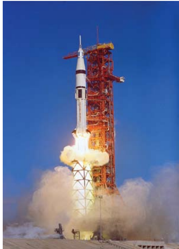
A Saturn 1B rocket carrying Skylab astronauts lifts off from Kennedy Space Center. Years later, after the launch stand was dismantled, its paint was found to contain toxic chemicals.