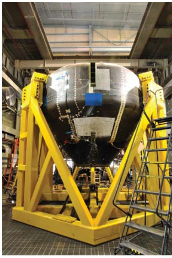
The Composite Crew Module allows NASA researchers to test materials and methods that may one day be applied to spacecraft constructed using composite materials.

Composites are an increasingly significant part of terrestrial applications, from transportation (the largely plastic composite airframe of the new Boeing