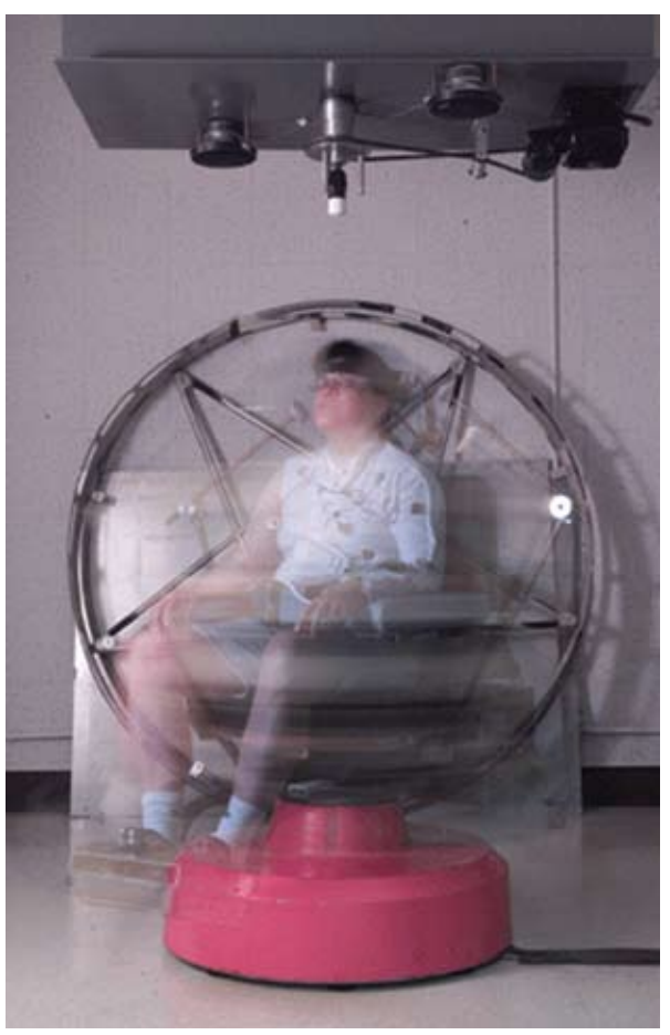
A subject undergoes preflight motion sickness testing in a rotating chair. NASA researchers developed a technique for overcoming the potentially debilitating condition.