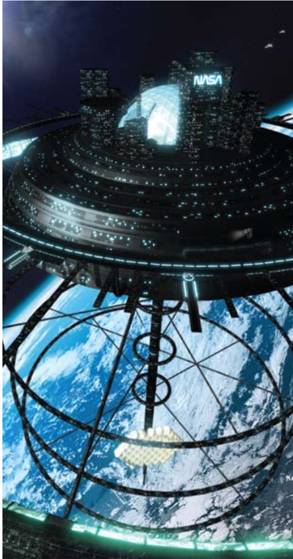
The space station shown here, “The Arthur C. Clarke Astronaut Academy,” is from a new game called Astronaut: Moon, Mars, and Beyond , which is being developed through a Space Act Agreement.

lunar architecture plans—as the basis for an engaging, inspiring, and fun game. The result was Moonbase Alpha .