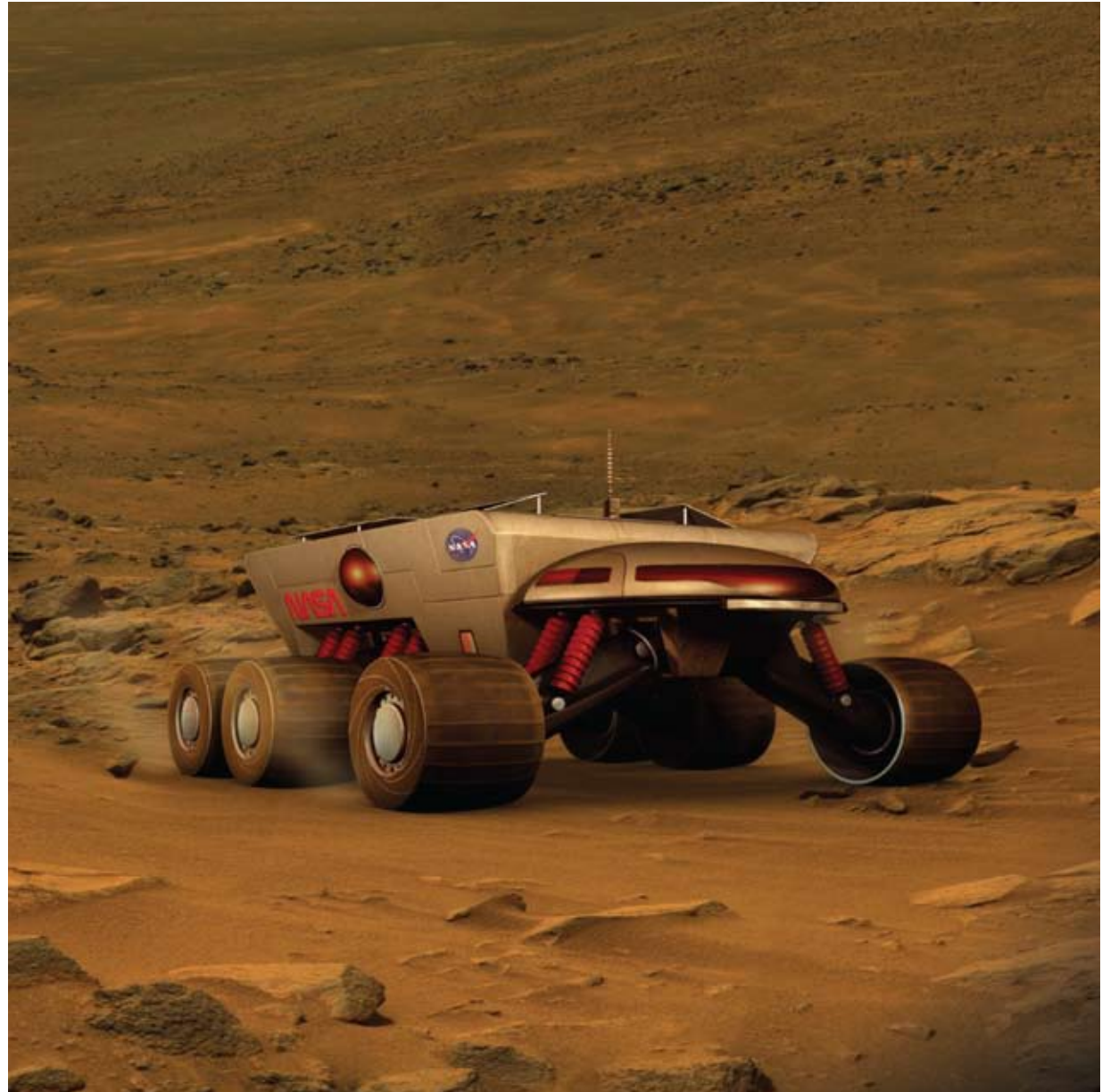
Astronaut: Moon, Mars, and Beyond , will feature game play in the asteroid belt, on Mars (as shown here), and in near-Earth orbit.

Virtual Heroes® is a registered trademark of Applied Research Associates Inc.