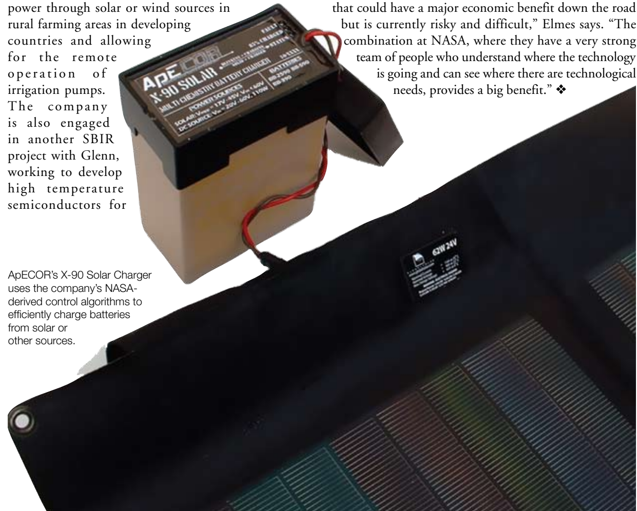
ApECOR’s X-90 Solar Charger uses the company’s NASA-derived control algorithms to efficiently charge batteries from solar or other sources.