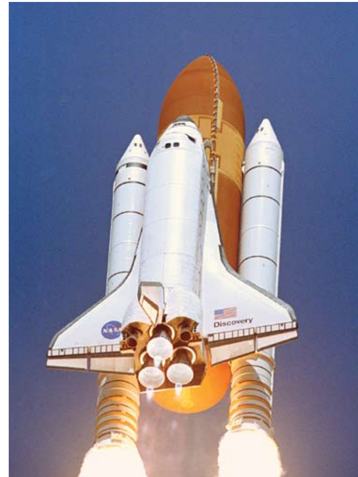
Space Shuttle Discovery launched on July 26, 2005, ending the wait for the historic Return to Flight mission following the Columbia disaster.

Over the next several years, the software was modified and updated, and now includes the NASA technology. According to the company, if used correctly, uPhotoMeasure can make measurements with at least 95-percent accuracy. Today, the software has close to 5,000 users who have downloaded the program to their computers or access the software on the Internet.