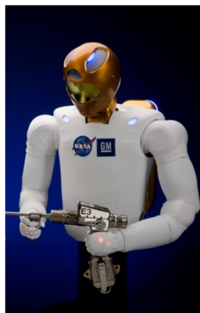
Figure 1: Robonaut 2