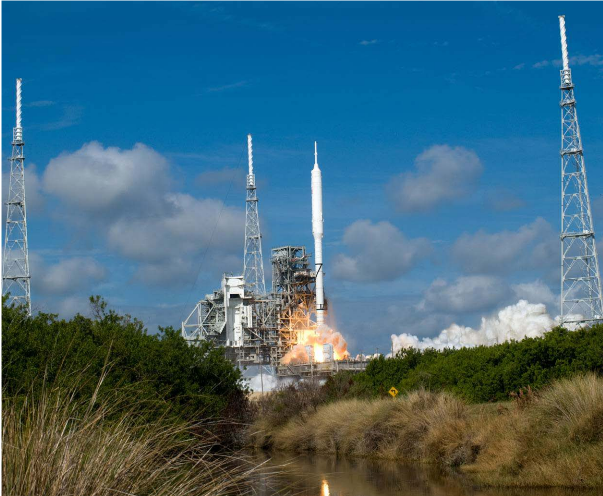
Launch of the Ares I-X rocket from KSC Launch Pad 39B on October 28, 2009.

Mission implementation was driven and structured around the development of the FTV. The first kaizen/lean event resulted in a reorganization of the mission into eight Integrated Product Teams (IPTs) led by the Ares I-X Mission Management Office (MMO). Five of the IPTs were focused on developing elements of the FTV; two of them on ground systems and operations at the launch site; and the eighth team were responsible for overall systems engineering and integration. The management of the mission was performed by the mission manager and MMO staff which included the integration and maintenance of the IMS. The IMS was the central tool used by MMO to evaluate the mission's probability of meeting the launch date. The project integration manager in cooperation with the deputy mission manager developed the IMS, and to ensure consistency with the kaizen/lean events the deputy mission manager was assigned the task of managing schedule margin and conducting the lean events.