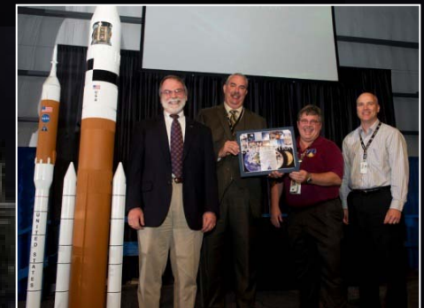
One of many awards received by the Ares I-X team