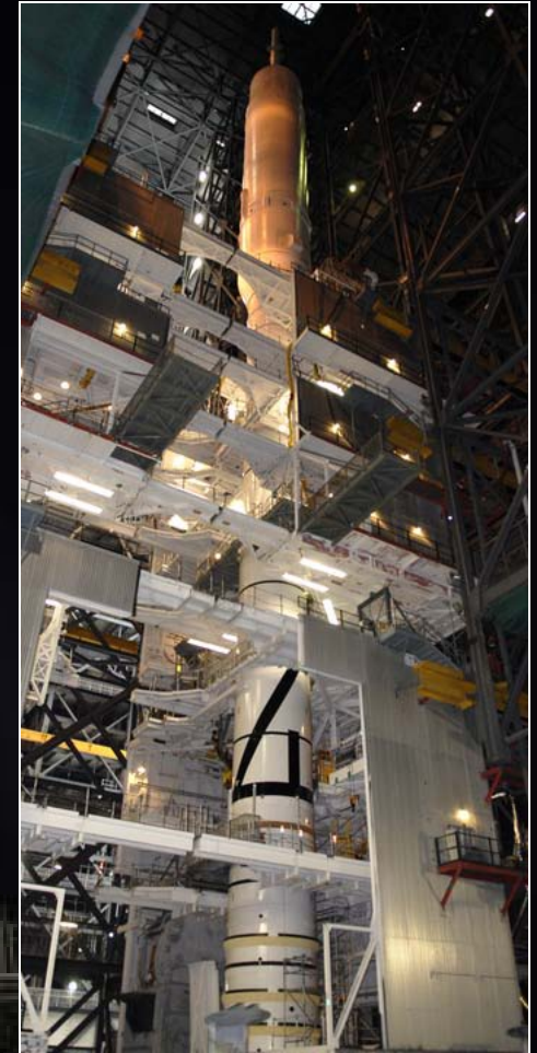
The FTV was 327 feet tall and only 26 feet shorter than the Apollo V Saturn Rocket.