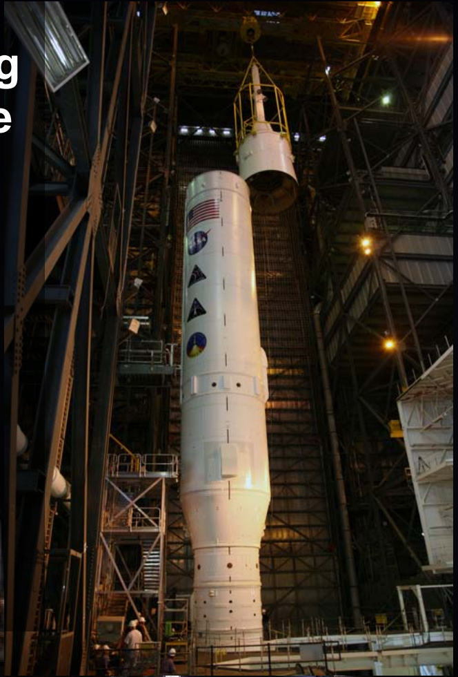
Stacking of the Ares I-X rocket at the Kennedy Space Center Vehicle Assembly Building as depicted by the final element being placed atop the Ares I-X Flight Test Vehicle (FTV) integrated stack.