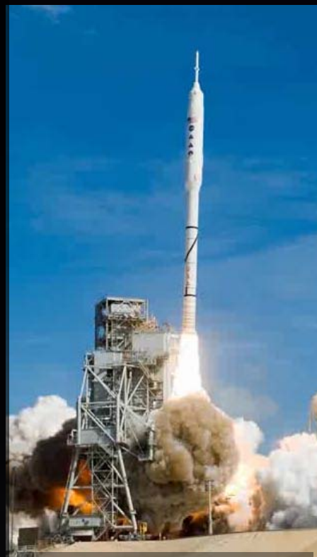
Launched Oct. 28, 2009