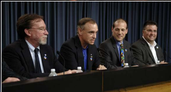
Stakeholders at an Ares I-X press conference.