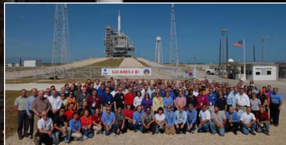
An Ares I-X team gathering after the successful flight test readiness review.