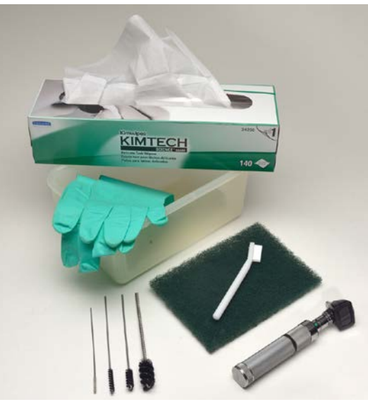
FIG. 3— Cleaning supplies and tools.