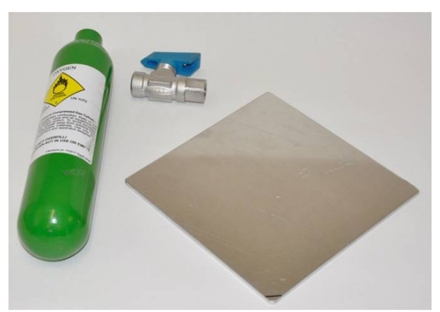
FIG. 1—Test articles representing parts of the oxygen system.