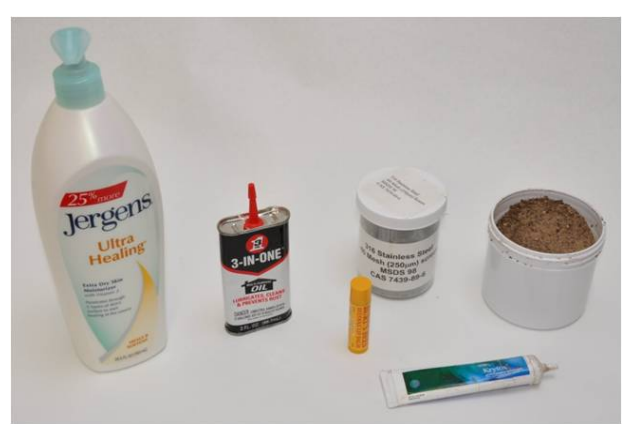
FIG. 2— Contaminants were chosen for likelihood to be used in the field.