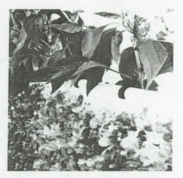
FLEX Aeroponic System for modular rapid pure food production for space and earth

Aeroponics International licensed the patent rights of the technology to its parent company, AgriHouse, Inc. Prototypes developed during the Phase I contract in 1999 were delivered to AgriHouse, Inc. which allowed them to commercialize the technology for a low-mass flex aeroponic growing system for both low gravity and terrestrial gravity applications for rapid crop production and expansion. In early 2005, the company began manufacturing of the flexible aeroponics systems that are modular and that incorporate the major advances of the Phase I work.