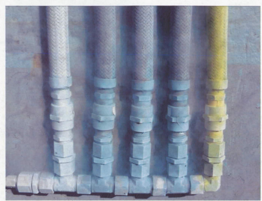
FIGURE 6 - Flex Hose Manifold Post-Immersion Warm-Up

Figure 6 shows the manifold after both cryogenic tests were completed. In the first test, cryogenic liquid nitrogen was pumped through the manifold. In the second test, the manifold was dipped in liquid nitrogen. Figure 6 shows from left to right: AR-7, Candidate 10, Candidate 9, Candidate 10 (diluted), and Candidate 6.