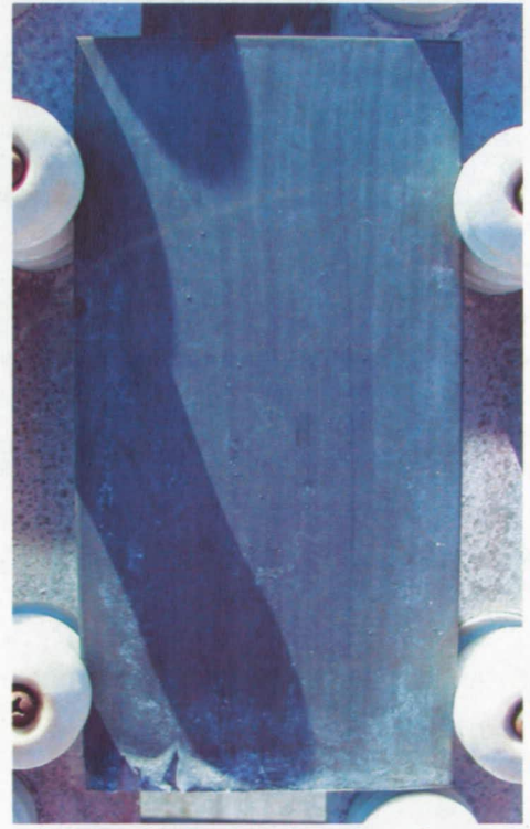
FIGURE 4 - Candidate 10 Delaminating from Bottom of Panel

After 3 months at the beachside atmospheric exposure test site, Candidates 3, 4, 7, 10, and 13 did not perform as well as AR-7 as seen in Table 1. Candidates 3, 4, 7, and 13 showed corrosion in the center of the coated carbon steel panels. The corrosion was evident on the panels rinsed with the solid rocket booster slurry simulant and the non-rinsed panels. The Candidate 10 coating on the stainless panels which was rinsed with the solid rocket booster slurry simulant started to delaminate from the bottom, as seen in Figure 4. Candidate 2 was not placed at the beach, since it corroded too easily in the salt fog chamber. Candidate 16 was still tacky, so it did not cure very well and was not included in the atmospheric exposure test.