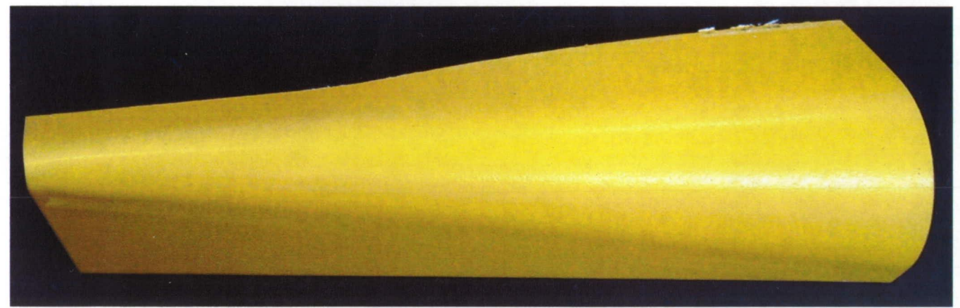
FIGURE 5 - Candidate 6 Panel after Mandrel Bend Test.

To show an example of the extent a panel was bent, Figure 5 shows a Candidate 6 three by five panel after the Mandrel Bend test. The coating did not crack or peel as a result of being elongated. AR-7 performed very well in the Mandrel Bend test also. There were no cracks evident in the coating after the coated panel was bent over a conical apparatus. AR-7 is very flexible. Candidates 3, 4, 10, 12, and 13 cracked upon being bent. Since the coatings are being tested for use on a flex hose, flexibility of the coating was important. Candidates 2, 5, 6, 7, 8, 9, and 14 showed no signs of cracks after being elongated as seen in Table 1.