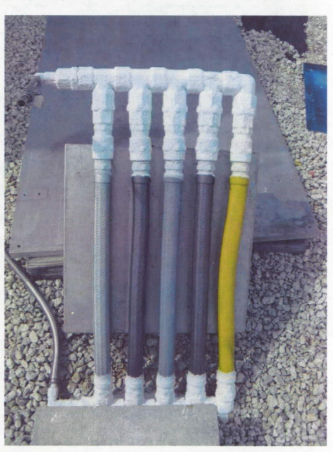
FIGURE 2 - Flex hose manifold.

A liquid nitrogen bath was used to simulate cryogenic spillage or other direct exposure of the flex hose manifold. The manifold was tested in two sections since it could not be totally immersed in the bath at one time. Prior to immersion, the manifold was allowed to warm to ambient temperature, purged with gaseous nitrogen, and capped at both ends. The cap on the ambient end of the manifold was loosened to allow for the escape of any trapped gas inside the manifold. The submerged end of the manifold remained in the bath for 5 minutes after quenching had subsided. After the manifold was allowed to warm-up, this process was repeated by switching submerged and ambient ends of the manifold. All flex lines were inspected after direct exposure in the liquid nitrogen bath.