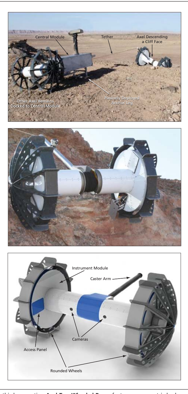
The third-generation Axel Two-Wheeled Rover features a symmetric body and a trailing link, and uses only four primary actuators to control its wheels, tether, and trailing link.

This generation of Axel has two science bays, which are large cylinders that fit into and are covered by Axel's cantilevered wheels. These bays can accommodate up to four small science instruments each. The contact instruments are deployed to the ground via a single-degree-of-freedom, four-bar mechanism. Some optical instruments do not require any deployment and can operate after pointing these sensors using the body actuators. Sampling devices such as a scoop or coring drill may also be deployed by the four-bar mechanism.