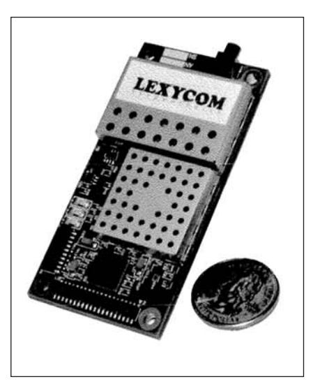
The EVA Software Defined Radio.

Currently, the radio is equipped with an S-band RF section. However, its scalable architecture can accommodate