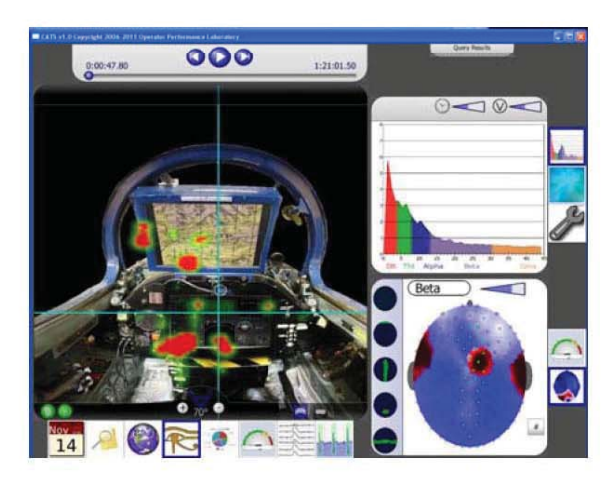
Figure 3. CATS workload monitoring system

The Cognitive Avionics Tool Set (CATS), shown in Figure 3, uses neurocognitive and physiological signals to generate a real-time measure of cognitive workload. CATS uses data from respiration, electroencephalogram (EEG), electrocardiogram (ECG), eye tracking, and galvanic skin response (GSR) sensors to measure a wide range of human neural and physiological characteristics. State-of-the art active shielding electrodes, combined with filtering and processing techniques, are used to reduce the effects of adverse noise and signal acquisition. The CATS framework was designed to easily accommodate new sensors and analysis techniques.