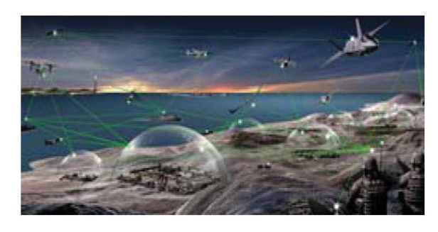
Figure 2. Cross domain solutions are a necessary component of network-centric environments, such as LVC systems, that require information sharing across all security enclaves

Assuming the data link challenge was solved and traffic could flow from one participant to another, it does not mean it is allowed to flow, according to classification rules. This cross-domain challenge is related to the fact that the virtual world must address security concerns often present in the real world scenarios. For example, an LVC system connecting a U.S. Marine Joint Terminal Attack Controller (JTAC) at the unclassified Camp Pendleton simulation facility to the Nevada Test and Training Range, which operates a number of Secret and Top Secret aircraft platforms, would be completely useless without a process for handling the hierarchies of data distribution and crossing classification domains.