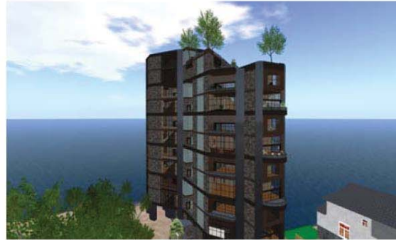
Figure 6: Faculty Offices

owned a Second Life account for years and had been accumulating the allowance, so she donated 80,000 Linden dollars (about $400) to the expansion. In March of 2011, a nine-unit apartment building was built on the second beach (Fig. 6) with a price of 10,000 Linden dollars (about $50). The nine units each had two floors. The top unit was the penthouse and was substantially larger than the other units and included an outdoor pool and deck area.