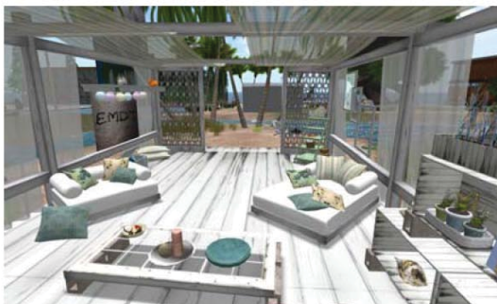
Figure 8: Beth's Beach

Not all of the faculty members liked the idea of having a space in the faculty building. Similar to the students, they expressed a desire to be outdoors. So, for one faculty member, Beth's Beach (Fig. 8) was built so she could have a space that reflected her personality. The area was designed to be an open yet defined office. One faculty member even contributed a photograph that was hung as art work on the wall.