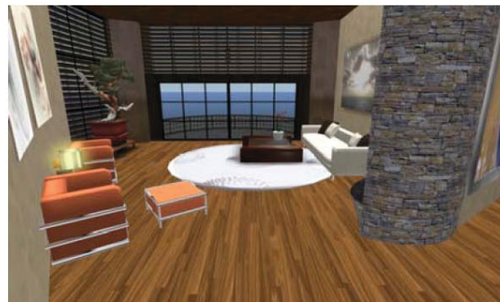
Figure 7: Penthouse

This space was set-aside as a student collaboration area (Fig. 7). The decision was partially practical, to avoid having to make a decision as to which faculty member would get the penthouse but more importantly, as a symbolic reminder of how important the students were in this project. The penthouse was decorated with furniture and art; additionally, the property was landscaped to complete a modern tropical theme.