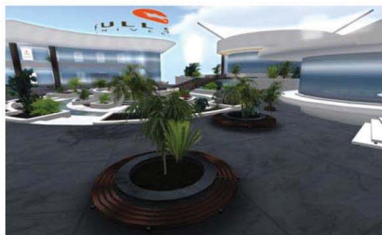
Figure 11: Redesigned campus

Newton's vision was lighter, brighter and seemed more inviting than the previous version (Fig. 11).