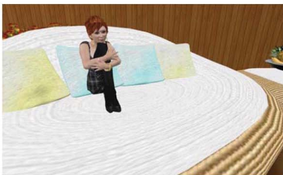
Figure 2: Casual sitting area

The beach property was prepared for class use by placing a new house on the property, well back from the water. This house didn't have the rooms that the previous house had but rather was basically a one-story roofed platform. The entire house set up on stilts. Underneath the house, a small patio was placed and furnished with casual furniture (Fig. 2). This proved to be a favorite among students and was usually the first place students sat when the class started.