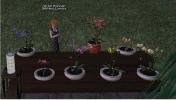
Figure 5: Orchid Room

Students could easily find an area to work in and the names also served for groups to use as a landmark to set up meetings.