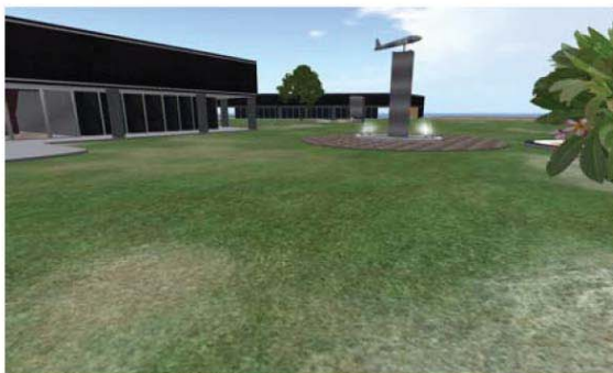
Figure 9: Full Sail campus – initial build