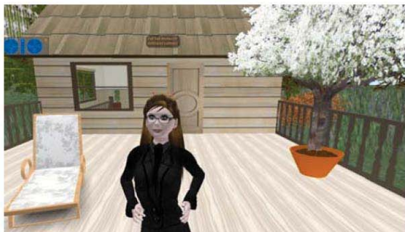
Figure 1: First property – upstairs deck

Students in the first month of the program gathered here on one designated evening of the term. Signs were placed on the property to answer questions about the team assignment associated with Second Life. Students were to join with their teammates, read the signs and select a topic from the short list provided. The instructor then gave a representative from each group a note card with two locations on it that related to the chosen topic. Students then left as a team to begin exploring Second Life. Students were told that they could come back to the land at any time but records for the land showed very little involvement outside of this one class meeting.