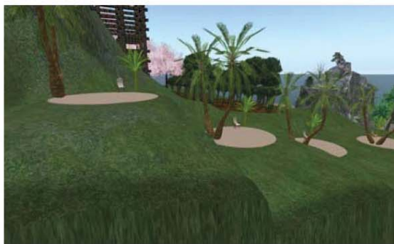
Figure 3: Land for sale

At about this same time, changes needed to be made to the way the land was used. The beach property was a good start but the one drawback was that there was no room for multiple groups to meet at one time. Also, the land was getting full and it was difficult to add anything new. Since the property was surrounded by small plots of land that were for sale, it seemed to be a good time to expand (Fig. 3). The changes in Linden Lab's ratings actually meant that many people moved to the newly opened areas and that resulted in falling land prices. Some of the smaller pieces of land (512 square meters) were selling for only 1,400 Linden dollars (roughly $7.00).