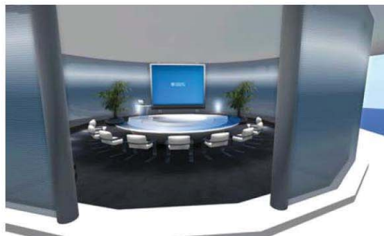
Figure 12: Classroom in Conference Setting

Furthermore, Newton created a classroom space that could swiftly be reconfigured at the touch of a button. The room could be arranged around a conference table or a desk and chairs or in a more casual open circle (Fig. 12).