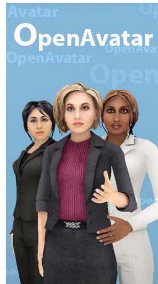
Figure 1. Collection of Female Avatars

Virtual world, game and sim developers often want to be able to generate Avatars (models which represent users in a virtual world). Until now there has been no Open-Source code project to generate 3D models with sufficient quality. Unless sufficient money was spent to create a proprietary system for that virtual world, users were limited to pre-generated models. This has been the case in many Enterprise virtual worlds and military simulations. This added the burden of creating all the end user assets on the 3D artists and led to multiple end users sharing the same avatar model due to the limited choices available and not having a photo realistic avatar to match their face. There is interest in the user's association with the avatar regarding immersion [1,]. Thus avatars with the user's