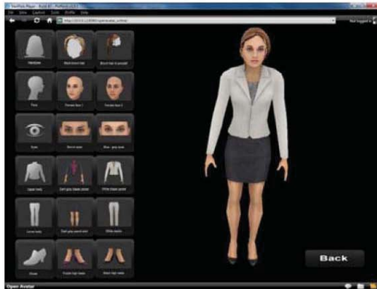
Figure 6. Interface for customisable avatar

A virtual world could have a web interface which would allow users to upload their custom avatars and models to give them greater creative control over how their world looks and feels. This would give a greater feeling of ownership to the user.