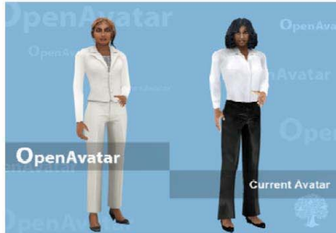
Figure 3. Comparison of OpenAvatar and Leading provider

As not all 3D models are static and will be animated; Collada supports the BVH animation format conforming to standards used in the industry.