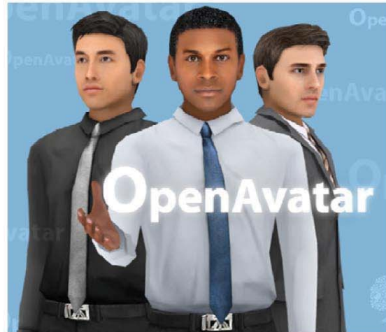
Figure 4. Collection of Male Avatars

The OpenAvatar public SDK is entirely free to use for commercial and non-commercial purposes alike. We hope this free model serves as an incentive for adoption and testing allowing the public SDK to develop and suit the needs of users and developers alike.