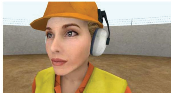
Separation of models into discrete

OpenAvatar is an open source software and specification that aims to streamline the development and integration of models into virtual worlds. By using COLLADA which is an open specification, models compiled by OpenAvatar can easily be converted into the run-time format of the virtual world they will be deployed in.