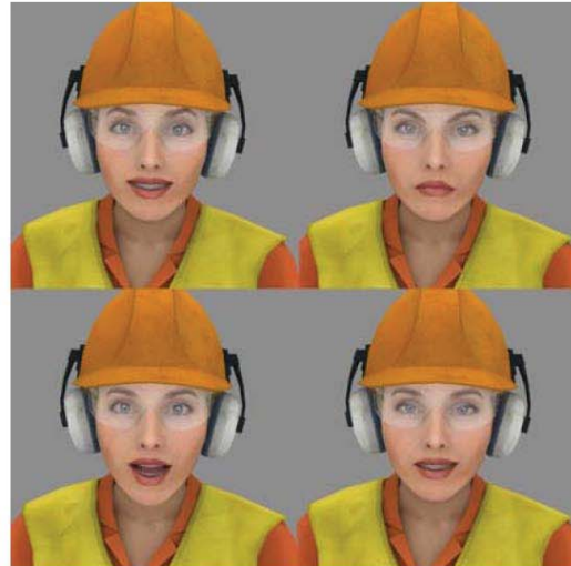
Figure 7. Facial expressions in action

The benefits to this are that avatars can be specifically assembled by users who do not come from a 3D artist background.