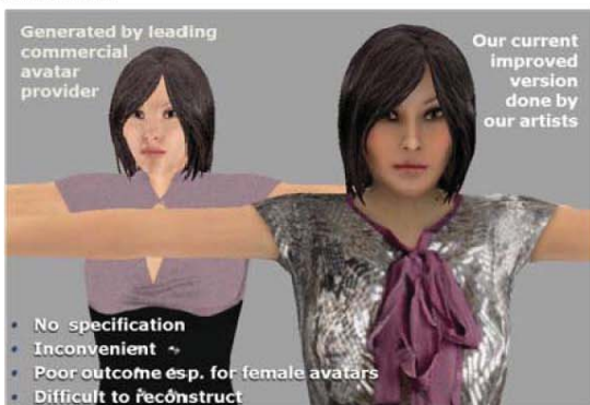
Figure 2. Avatars from leading provider

Modularity is a major benefit in the process of generating models. For example, a human model could have endless combinations of garments that the model could be representing. This is not just a simple matter of changing the skin, but also changing the mesh of the model; simply swapping out the skin for a man wearing a suit to jump suit will be detrimental to the aesthetic of the model and its believability. There are strong demands and advantages to having models where the components can be swapped out according to the context. Take an instance where a user may have their face modelled to their avatar. If they switch contexts, such as moving from being a pilot to a doctor, they would still be able to keep their face. This would give the user a greater sense of ownership and allow them to associate more with their avatar, further immersing them within the virtual world. OpenAvatar is not just limited to Avatars which are representations of humans in a virtual environment; they can be used to model anything from furniture to vehicles to animals.