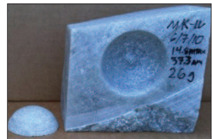
Figure 2. Photograph of Soapstone Sample (left) cut from parent rock (right) by the Rockballer prototype; the sample is 14.8 mm deep and has a mass of 26 grams.

The Rockballer has the added advantage of being able to also function as a